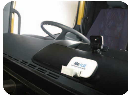
Class 5 – HGV

M6 Toll provides a dedicated Tag lane at our Great Wyrley and Weeford Park toll stations, where the Tag (T) symbol and an arrow will direct you down the wide load lane. You can also use one of the standard lanes with a T symbol, available at all toll stations.