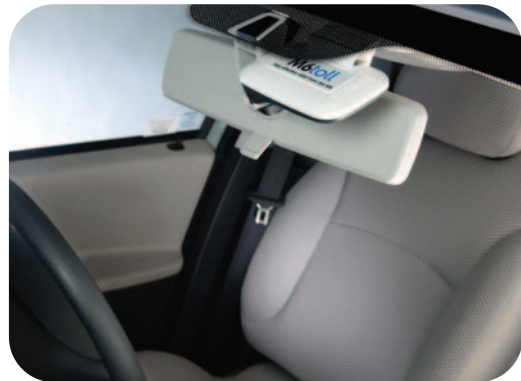
Class 2 – Car

To open an account, just go online at www.m6toll.co.uk , call our Customer Services team on 0870 850 6262 between 08.30 and 17.30 weekdays, or visit the Motorway Service Area at Norton Canes between 08.00 and 20.00 weekdays.